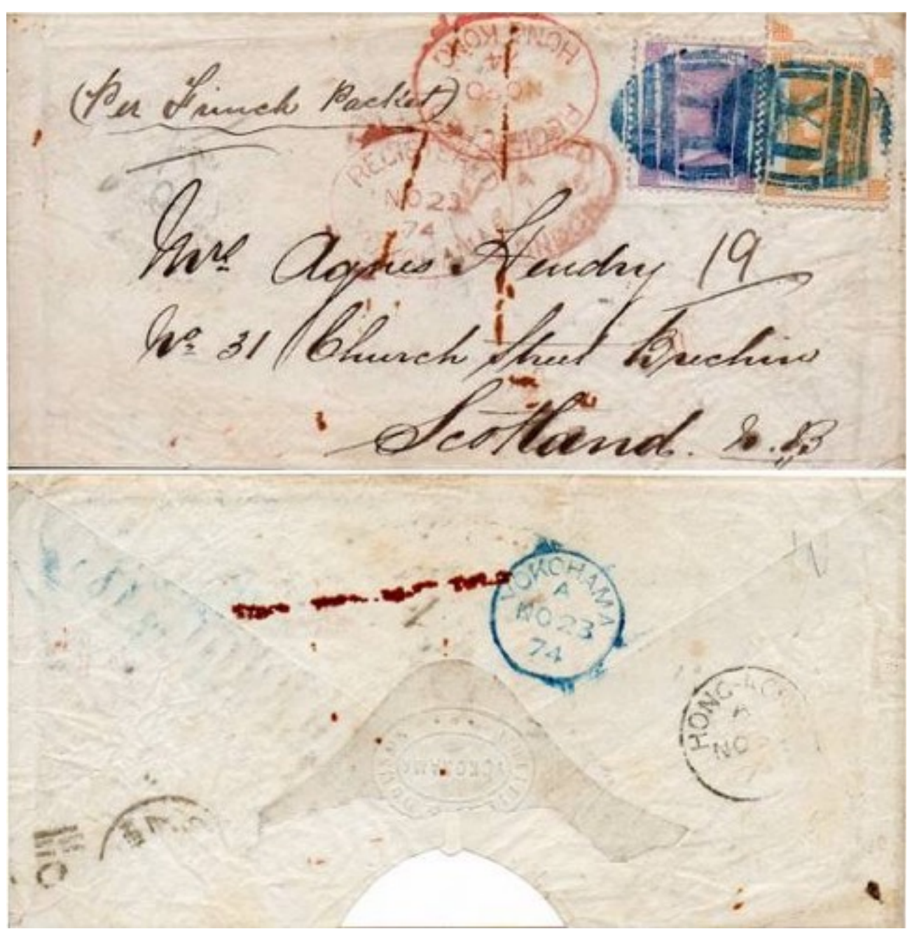
In the collection of a Hong Kong collector

The third letter dated 23 November 1874 endorsed French Packet and was sent by the Menzaleh 24 November to Hong Kong arriving on 30 November, then carried by French Packet Pei-Ho to Marseilles. The stamps are cancelled by thick "Y1" in blue.