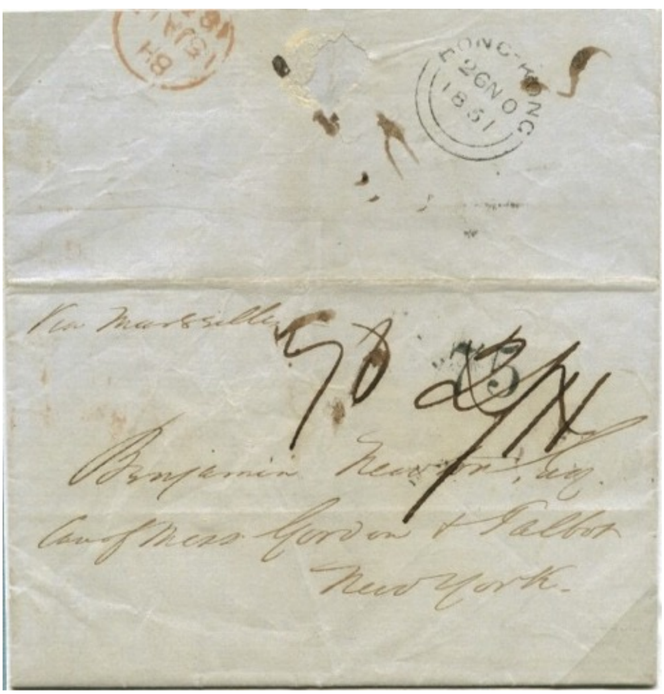
Figure 1 Figure 2

It is not often that one gets an chance to own two letters sent on the same day from the same place on almost the same itinerary and yet they show many differences. Illustrated here are two folded letters from Shanghai to U.S.A., figure 1 to Boston and figure 2 to New York, both sent via Hong Kong, Suez, Marseilles, London and then trans-Atlantic to U.S.A.