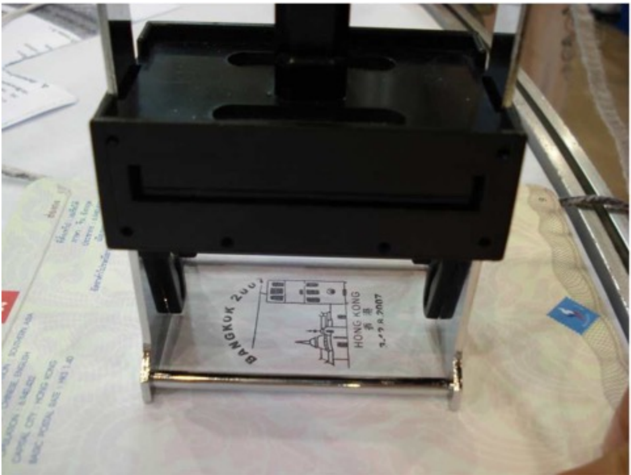
Cachet - Hongkong Post [Trodaf] version