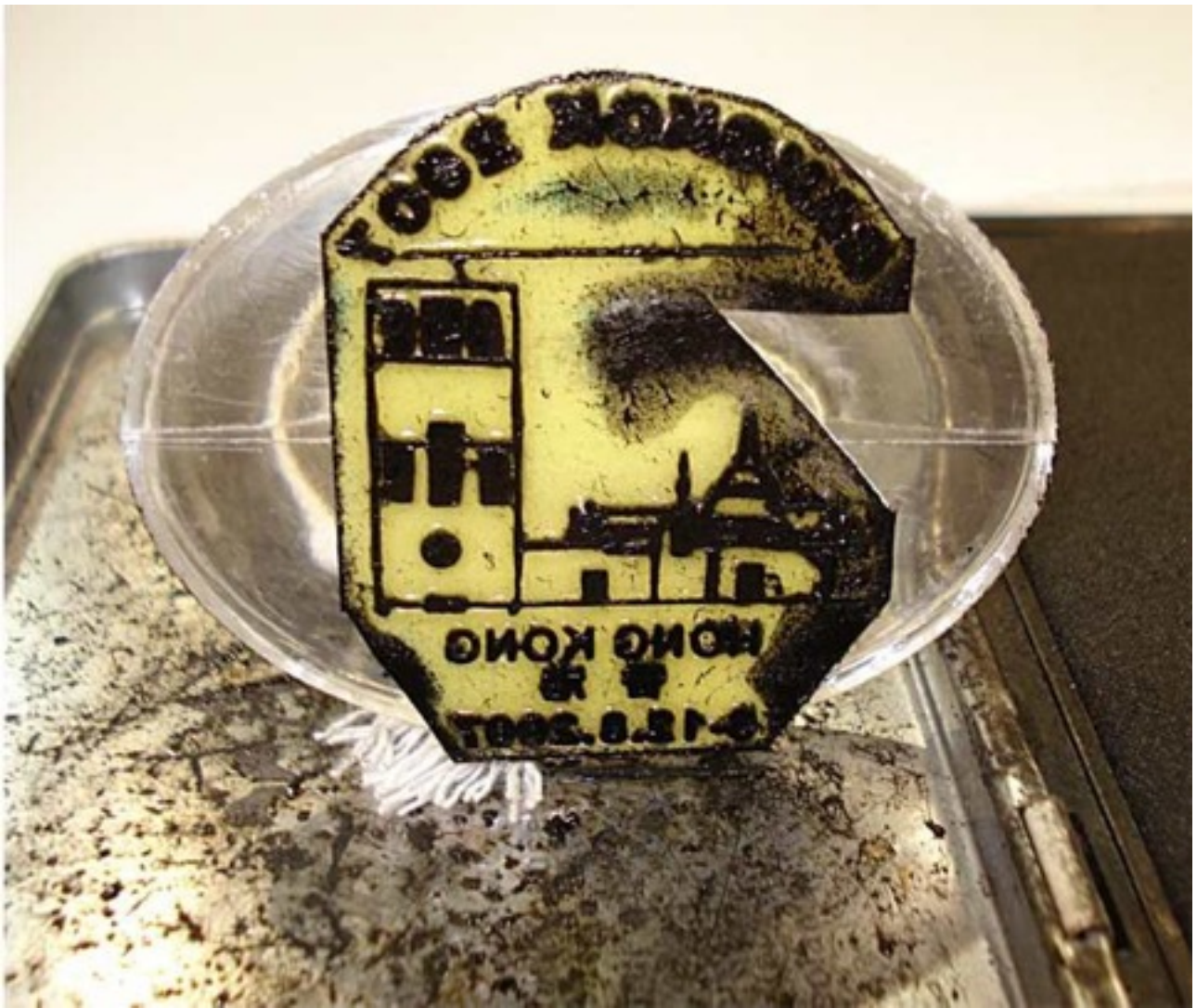
Cachet - Local version