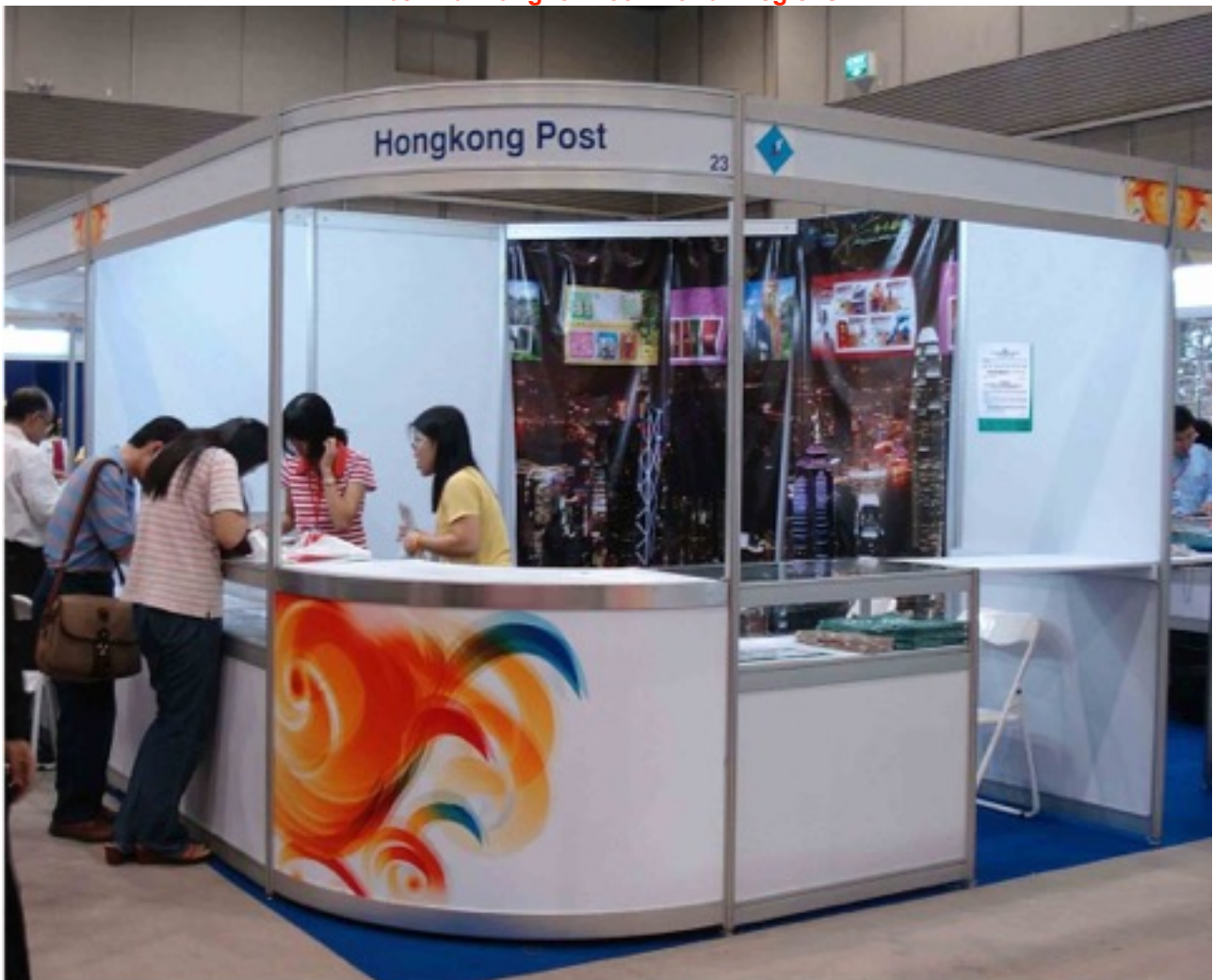
Hongkong Post Booth at Bangkok 2007

'?' behind 'Bangkok 2007?' and '..regions?'