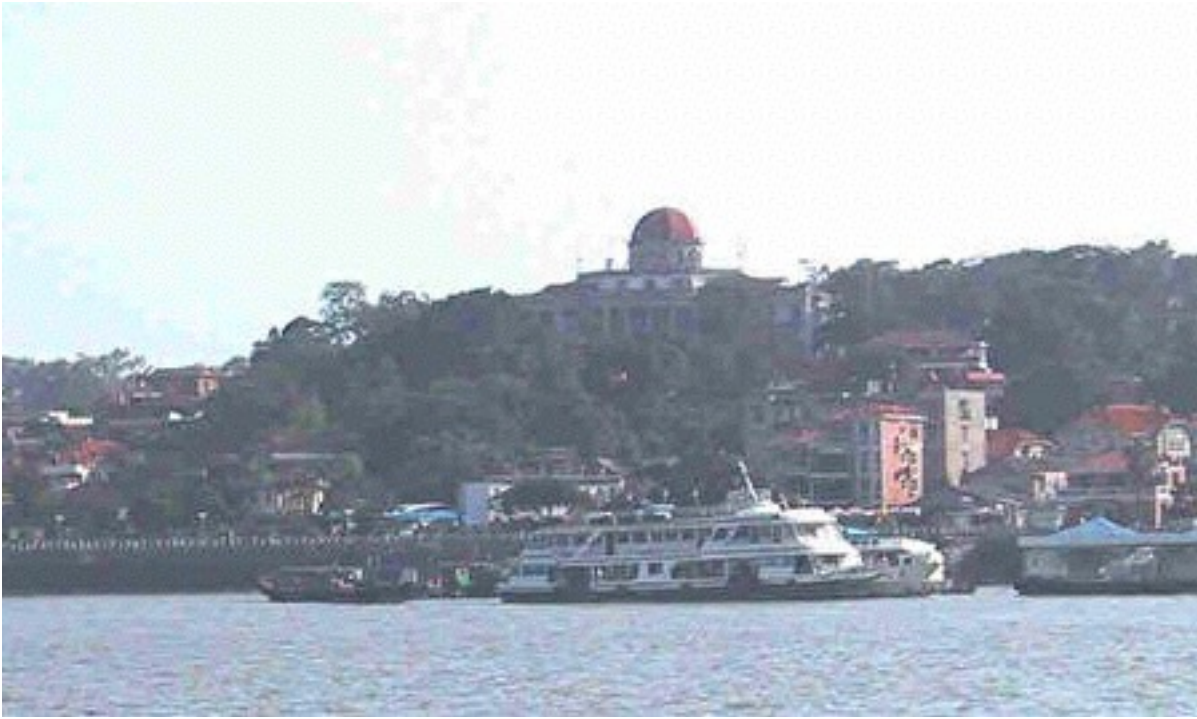
Picture of Ku Lang Su island taken in 2000 by the author showing the old British Consulate